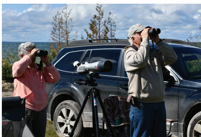
Mackinac Straits Raptor Watch continued its long-term research into migrating birds this fall, observing hawks, owls, waterbirds, Sandhill Cranes, and Monarch butterflies.

Night-time migration research is well underway. MSRW has banded a record number of 311 Northern