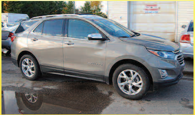
2018 CHEVY EQUINOX ONLY 7.5 K miles. SALE PRICE $24,995 As low as $349 a month

We service what we sell and also service cars we didn't sell!