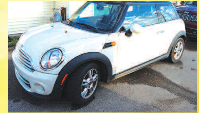
2012 MINI COOPER Leather, only 79 K miles. SALE PRICE $8,995 As low as $219 a month

Bring in your current car and see how much we can offer for it in trade.