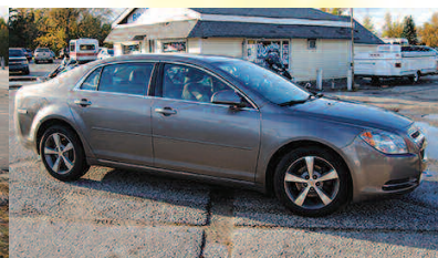
2011 CHEVY MALIBU LT SALE PRICE $4,995 As low as $199 a month