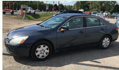
2003 HONDA ACCORD 120K, 5 speed. SALE PRICE $3,900