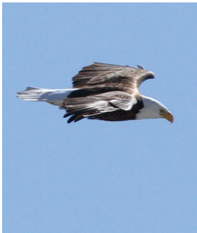
A Bald Eagle soars above the Straits.