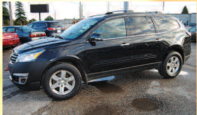
2014 CHEVY TRAVERSE SALE PRICE $12,995 As low as $299 a month