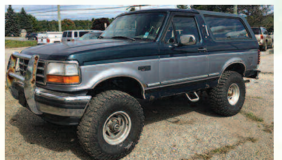
1984 FORD BRONCO XLT Full size, moonroof, 4x4. SALE PRICE $5,000