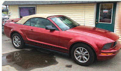
2005 FORD MUSTANG CONVERTIBLE Leather, 5 speed, 4.0L. SALE PRICE $7,500