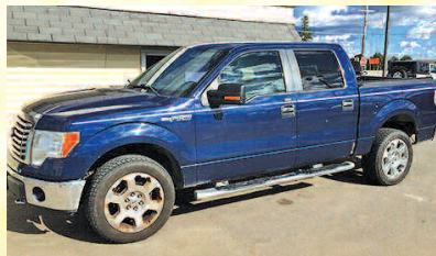
2010 FORD F-150 Club cab, soft tonneau cover, tow pkg, bedliner. SALE PRICE $8,900 As low as $249 a month