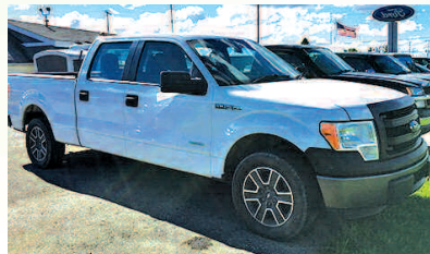
2014 FORD F-150 XL Club cab, spray in bedliner, back rack, tow pkg. SALE PRICE $10,700 As low as $249 a month