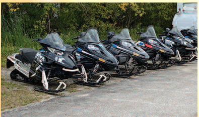
MORE THAN 20 SNOWMOBILES 2012-2017 ARCTIC CAT 570'S AND 4000'S All start easily. Some electric start. Reverse. SALE PRICE $4,500