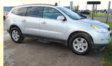
2011 CHEVY TRAVERSE SALE PRICE $9,999 As low as $229 a month