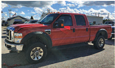
2008 FORD F-350 SUPER DUTY XLT DIESEL, plow ready, club cab, club cab, bedliner, tow pkg, 5th wheel bracket. SALE PRICE $12,900 As low as $275 a month