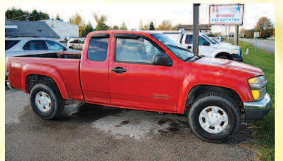
2004 CHEVY COLORADO 4x4. SALE PRICE $6,995 As low as $219 a month