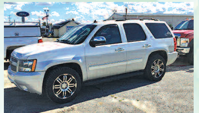
2010 CHEVY TAHOE LTZ Leather, tow pkg, DVD. SALE PRICE $5,900 As low as $199 a Month