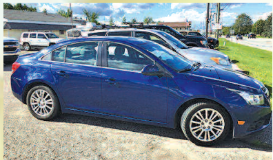
2012 CHEVY CRUZE Great MPG. SALE PRICE $5,800 As low as $199 a Month

PLUS... We offer extended warranty coverage through [Portfolio] that is effective anywhere in the USA or Canada.