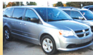
2013 DODGE GRAND CARAVAN SALE PRICE $5,995 As low as $179 a month