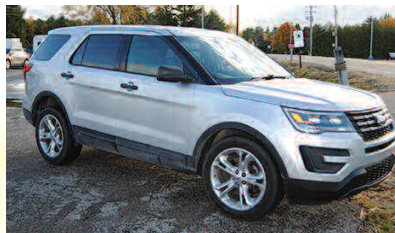
2015 FORD EXPLORER Leather. SALE PRICE $17,995 As low as $349 a month